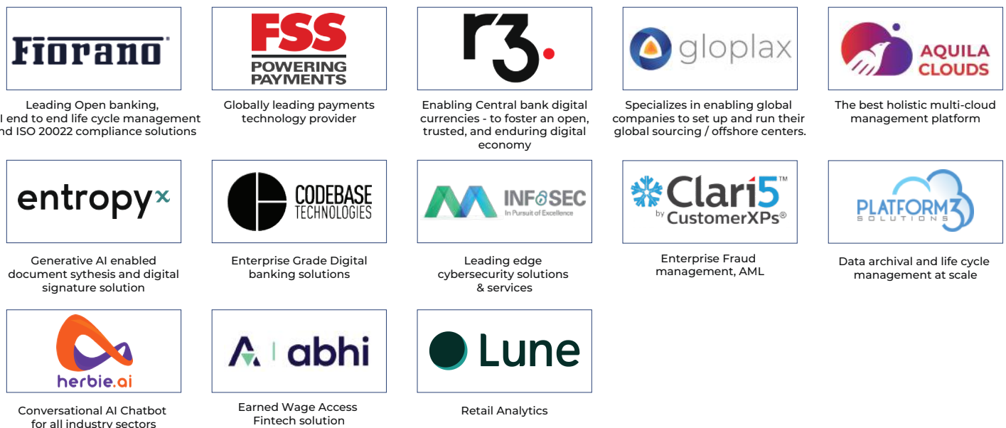
Leading Open banking, API end to end life cycle management and ISO 20022 compliance solutions